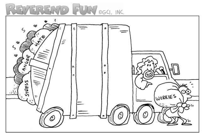
NEED A LIFT?