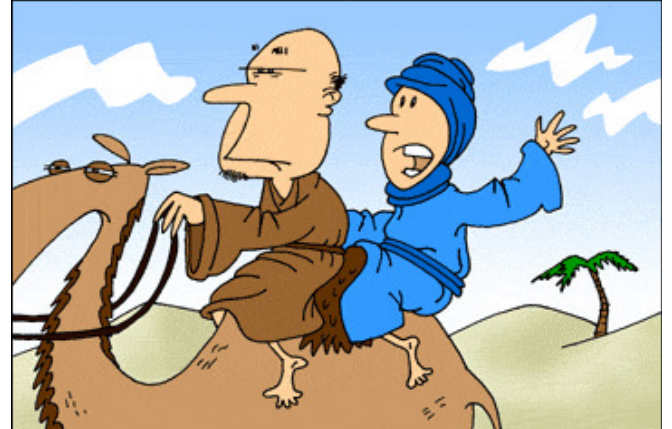
SLOW DOWN ... WATCH OUT FOR THAT OASIS ... CAREFUL FOR THE DUNE ... CAN'T YOU SEE THAT PALM TREE?